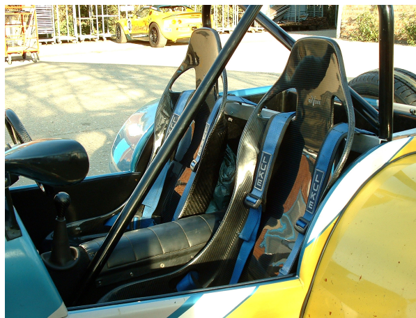
Mulsanne B in Dax Rush on side mount frames

When fitting, please ensure where the seats bolt to the chassis or floor pan is suitably reinforced back to the main chassis members to provide adequate strength. Bolting through a 1 or 1.5mm alloy/ steel floor simply will not be safe or comply with SVA / MOT requirements. When using rigid side mounts ensure that the bolt protrudes 8mm into the seat and no further as you could damage the seat, use the four m8*12 bolts and washers provided.