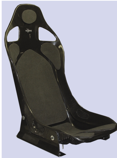
Mulsanne B shown with side mount subframe Also shown with R01SI0007 seat cushion trim kit.